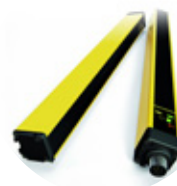
GENERAL AND SAFETY